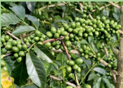
TaCRI aims at developing high yielding, high quality disease resistant varieties

For any organisation or business to succeed, it is very important to have a clear focus against which activities can be planned and progress can be judged.