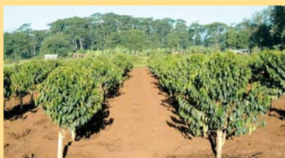
Above: a coffee field after rehabilitation. Right: a neglected field before rehabilitation.

and which have good bean size and cup quality. These new varieties will be put under accelerated multiplication over the next 5 years and will be used in a massive national re-planting programme scheduled to start in 2007. The breeding programme will be reinforced by the appointment of a new experienced plant breeder, with visiting regional and international technical assistance.