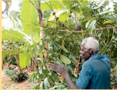
Demonstrating the impact of Coffee Wilt Disease in Kagera

400,000 farmers and their families derive livelihoods from coffee-based farming activities in Tanzania. Little is known about the social and economic factors that contribute to the sustainability and success of their contrasting agricultural and livelihood systems. In order for TaCRI to provide really meaningful and relevant technologies and advise to these many farmers, it is crucial