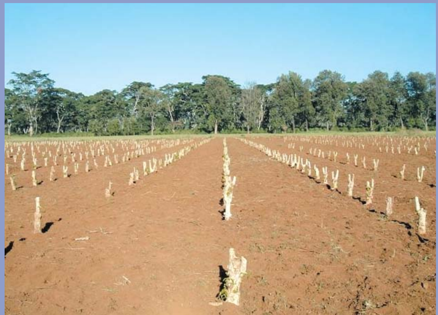
Rigorous pruning is required to start the rehabilitation of neglected research trials.

In short, this research area can be summarised under the title 'income security' to reflect the need to focus research on livelihoods dependent on cash to sustain them, and not just on technologies that may or may not be affordable. TaCRI will respond to this need although it has not been normal to include it in the mandate of traditional crop based research institutes in the past.