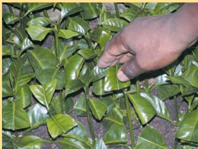
Nurturing new coffee seedlings taken from mother trees

One of TaCRI's most important roles is the development and mass distribution of new disease resistant, high quality and high yielding coffee varieties.